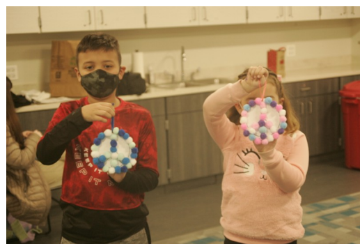
Peace Sign crafts