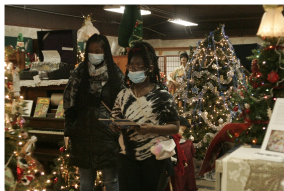
Christmas trees scavenger hunt