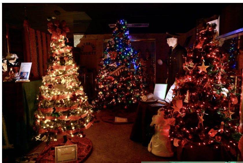
3 of the 37 beautiful trees that were on display