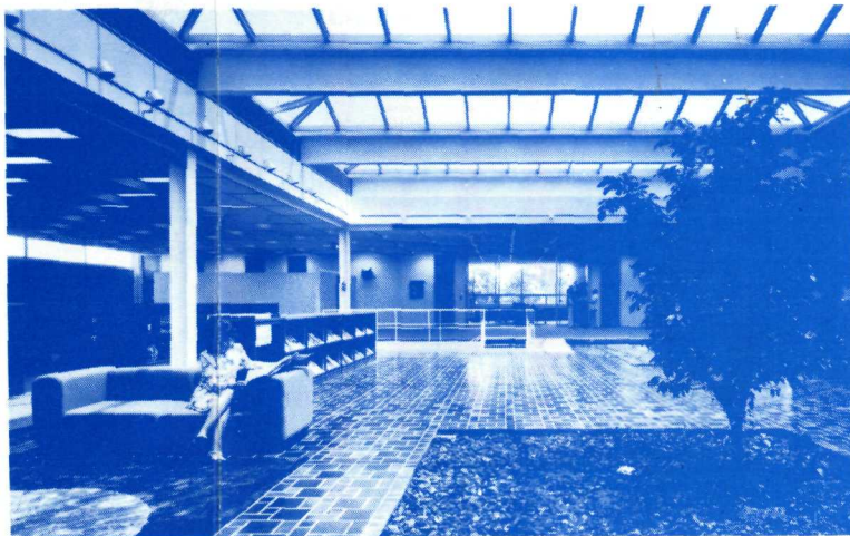
LIBRARY INTERIOR — Center stairway leads to lower level-Calvin Frank Community Room and Lansing Historical Museum:

LANSING PUBLIC LIBRARY 2750 Indiana Ave. Phone 474 2447